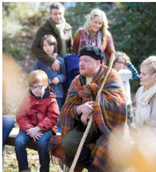
Country Estate Forage Day at Ashbrooke House (FVLP)